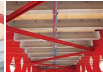
Galvanized steel crossmembers