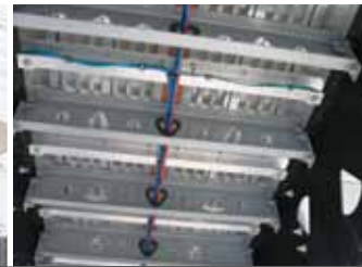
60,000 lb. capacity coil package