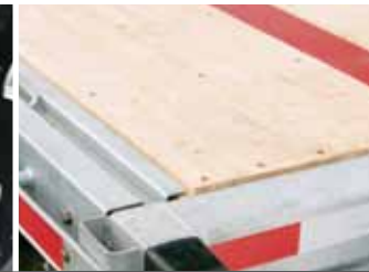
Wood floor available