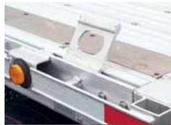
Cargo hands as internal anchor points